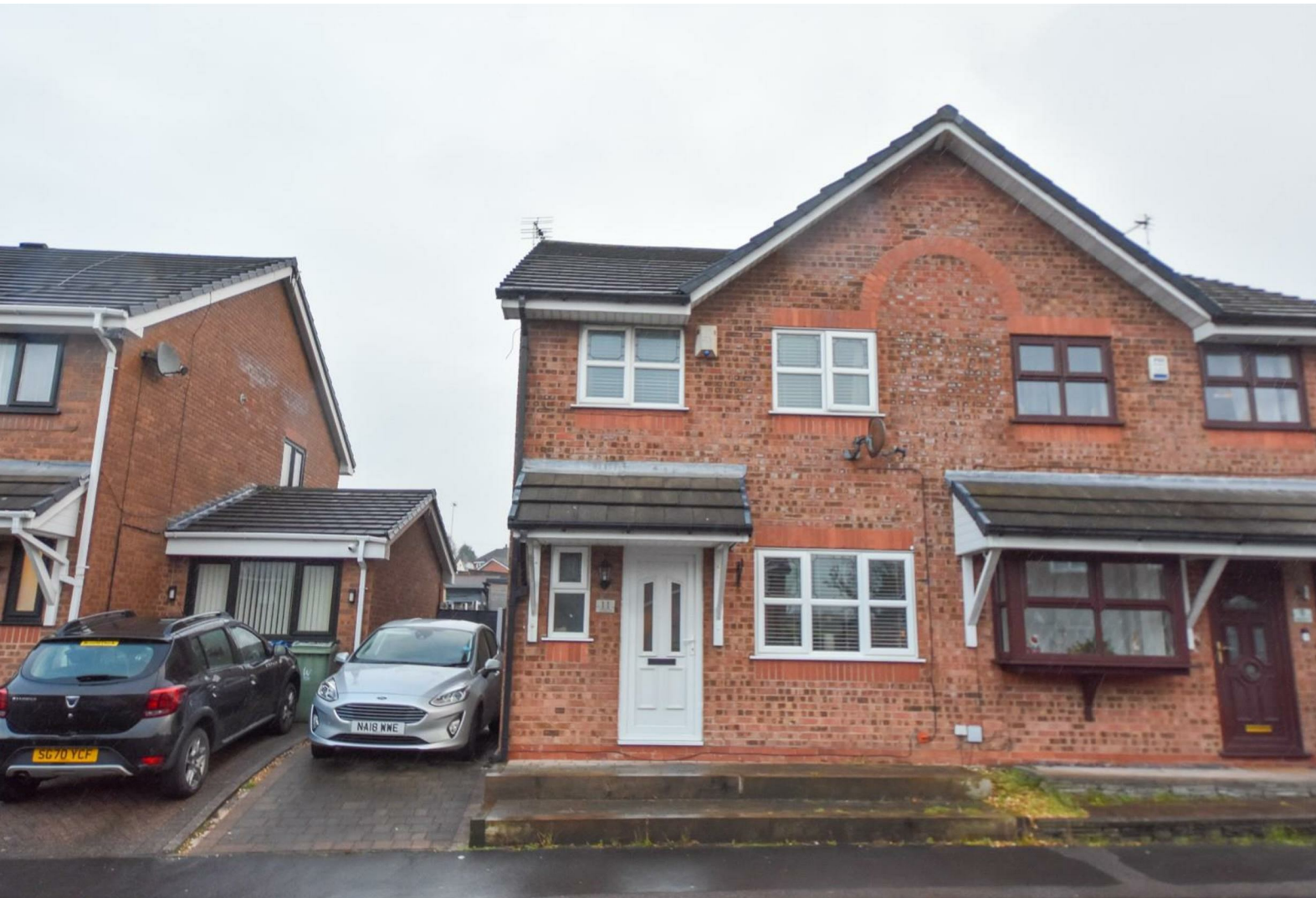
11 Abbeyfields , Wigan, WN6 7NZ